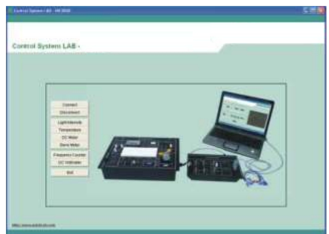
Application software window

Note: Specifications are subject to change.